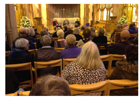
Image: Ecumenical gathering at St Nick's Church during the Eucharistic Congress

Northern Bishops of the Anglican Province to the Diocese of Liverpool in April 2019. This is a great common witness to Christians on Merseyside and beyond.