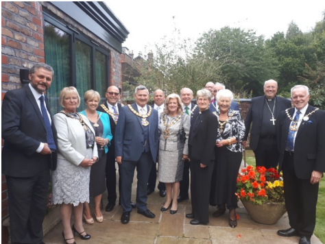
Civic Reception at Archbishop's House in 2017.

CTMR Presidents will also host a Civic Reception for Mayors and Leaders of the Councils in the Merseyside Region. Many replies are coming in at present. This year's Civic Reception will take place at Bishop's Lodge.